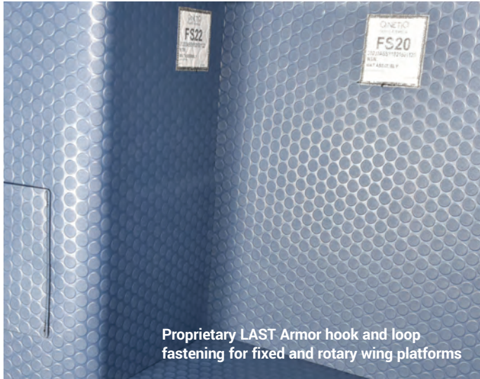
Proprietary LAST Armor hook and loop fastening for fixed and rotary wing platforms