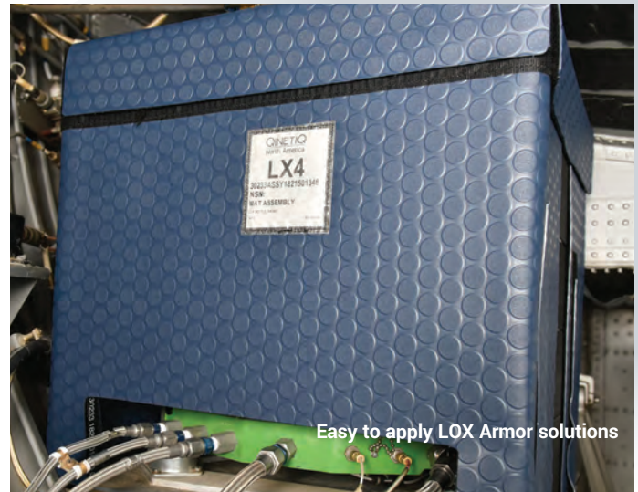
Easy to apply LOX Armor solutions