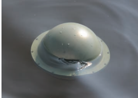
Riverine Drifter deployed in Pearl River, Mississippi