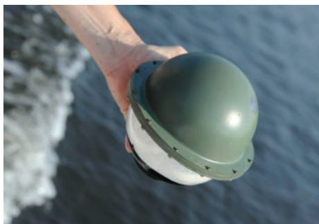
Riverine Drifter (6 inch diameter < 4 lb)