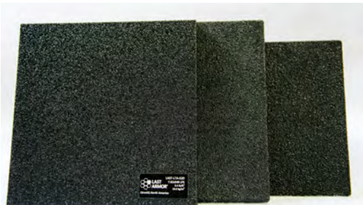
LAST Armor aircraft panels

Since its debut in Operation Desert Storm in 1991, LAST Armor has protected thousands of combat air and land vehicles. Today it is installed in over 40 different aircraft and in 16 allied countries around the world. LAST Armor is used by the armed forces, U.S. Military, foreign allies, commercial OEMs, and law enforcement agencies.